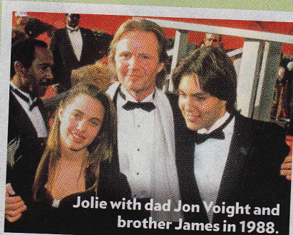
Jolie with dad Jon Voight and brother James in 1988.